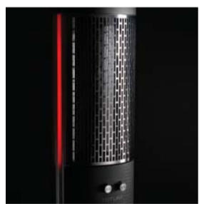
1. Ambient lighting