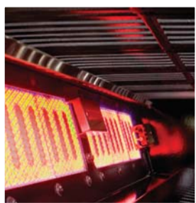
2. Crossray® technology