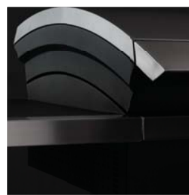
3. Excellent design